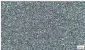
HOMOGENEITY OF EUTECTIC CARBIDE: LEVEL 0

Due to its elaboration by powder metallurgy with Hot Isostatic Compression the typical size of the carbides is lower than 5 \mu\text{m} and the level of cleanliness is far better than conventional cold work tool steels.