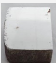
17 4 PH