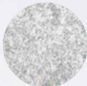
LARGE GRAIN CARBIDE SIZE: \leq 4.8 \mu\text{m}